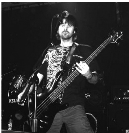
Newport City: Jumping in July